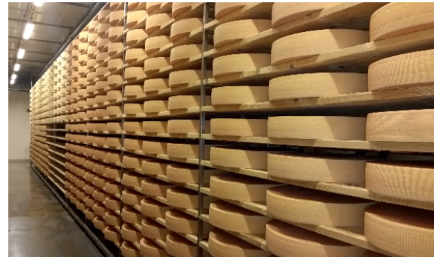
Cheese maturing cellar