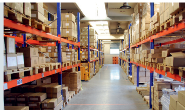
Warehouse & logistic