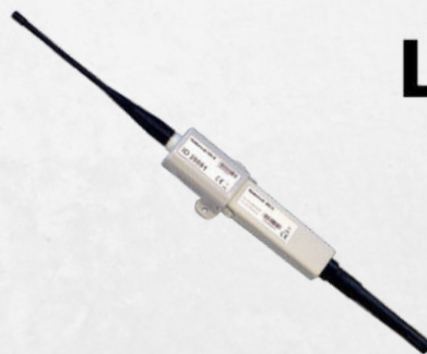
flex nSens HT-ENS with Sensor